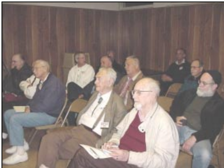
The Assembly of the "Deserving"

Respectfully Submitted: Ron Panton, W6VG, acting secretary.