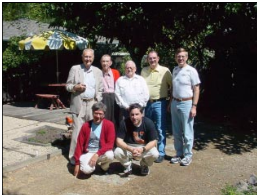
Here is your 2000-2001 Board of Directors. Front row, Lt to Rt; KN6K, Secretary, AA6W, Vice President. Back row, Lt to Rt; W6TWO, Dir., W6WB, Dir., K6RK, President, W6KM, Dir. and WB6JJJ, Treasurer