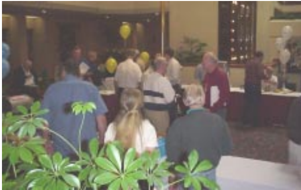
N6VAW & W6UDS View the Proceedings