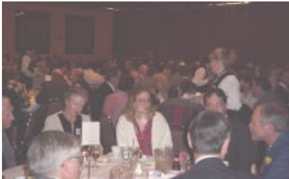
A Partial View of the Sat. Night Banquet.