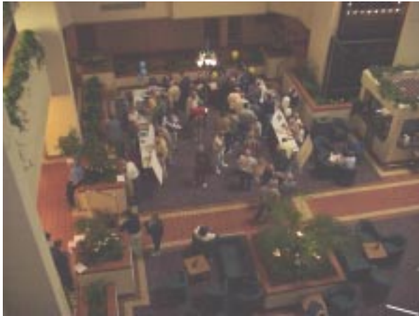
Pre Reg Pick Up, Walk In Registration & Raffle Ticket Sales