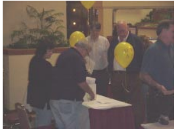
K6KAY & K6DB Doing Duty at Pre-Reg Pick Up