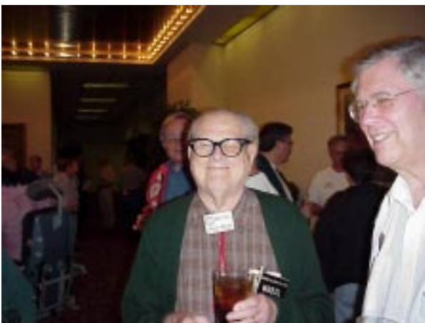
50 Years and Counting! Ain't it Great!!