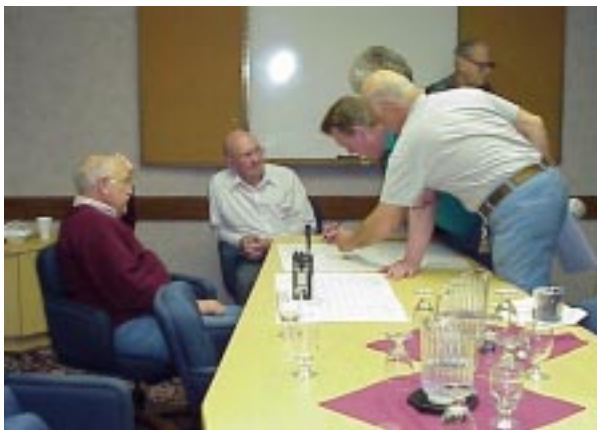
Table Sign Ups Were Brisk at times!!